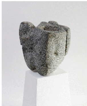
Örn Þorsteinsson b. 1948 Moonbowl