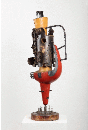
Jón Benediktsson 1916–2003 Sculpture