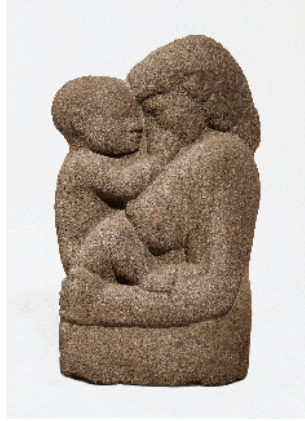
Tove Ólafsson 1909–1992 Mother with Child