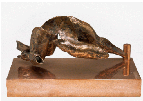
Helgi Gíslason b. 1947 Sculpture